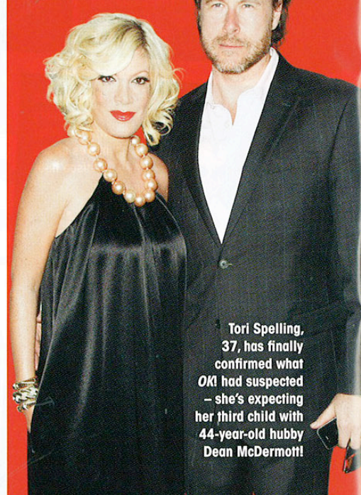
Tori Spelling, 37, has finally confirmed what OK! had suspected - she's expecting her third child with 44-year-old hubby Dean McDermott!